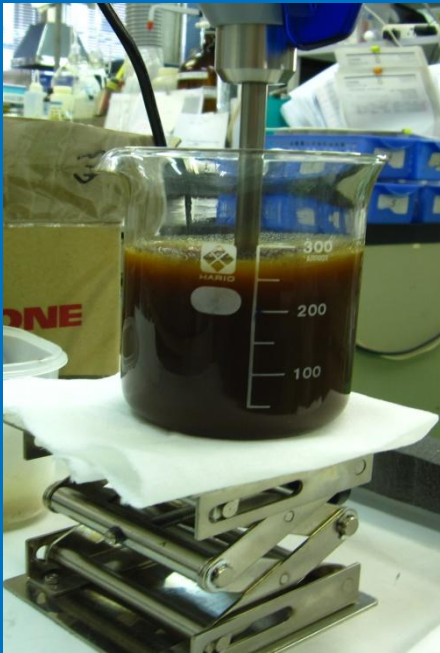
Mixing of Oil & Water