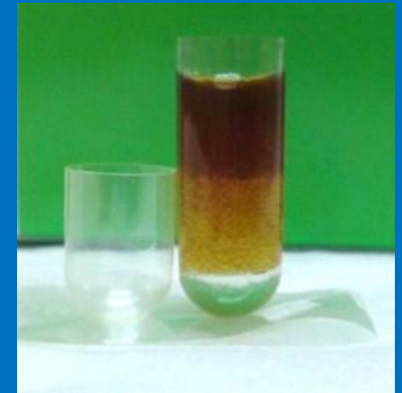
Capsule for Measurement